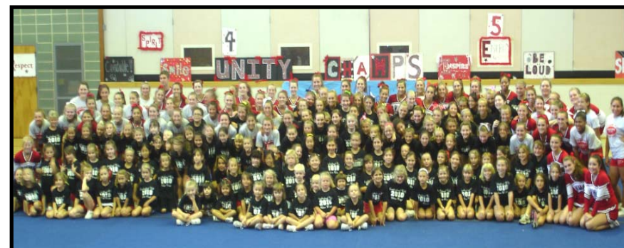
2010 CV CHEER CAMP

Please submit this registration form along with the $55 non-refundable fee (Check payable to CV Cheer Boosters) and mail to: CV Cheer Camp, 3607 Horsham Drive, Mechanicsburg, PA 17050 All registrations are due Thurs. Aug. 4 . See you at Cheer Camp!